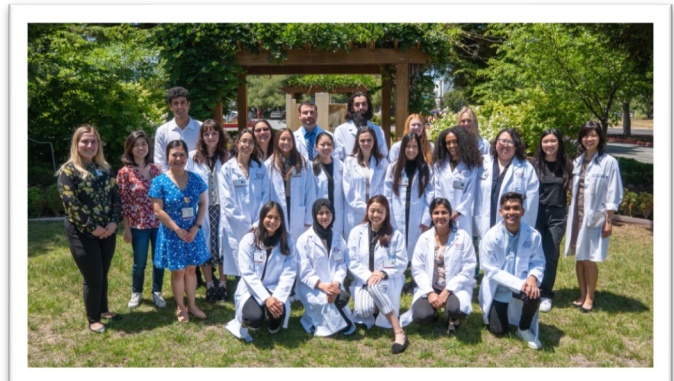
Class of 2023-24

For more information and to apply, visit our website: